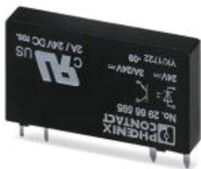
Plug-in miniature solid-state relay, power solid-state relay, 1 N/O contact, input: 24 V DC, output: 3 ... 33 V DC/3 A

Please be informed that the data shown in this PDF Document is generated from our Online Catalog. Please find the complete data in the user's documentation. Our General Terms of Use for Downloads are valid ( http://phoenixcontact.com/download )